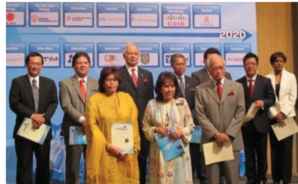
2011: SEGi at the launching of the Economic Transformation Programme (ETP), also in attendance was then-prime minister Dato Seri Najib Razak.