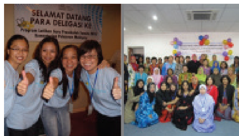
2010: Trained over 3000 private preschool teachers throughout Malaysia under the Ministry of Education Kursus Guru PraSekolah Swasta Project.